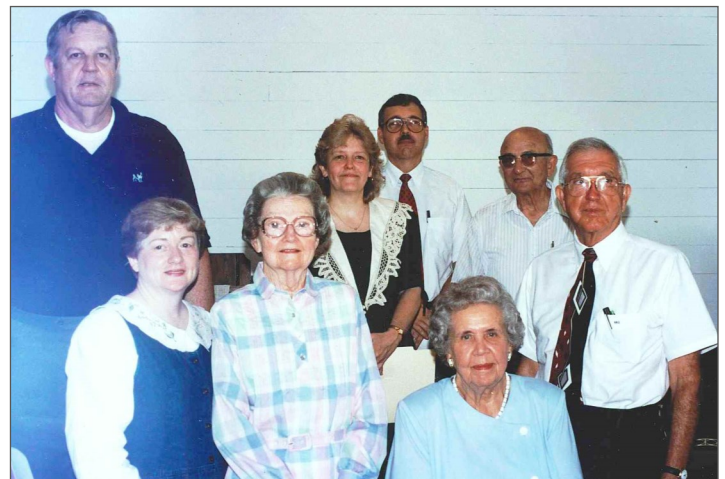
Archived photo from the Midway Methodist Church dedication dated May, 20 1995

Most of the structures probably would have been demolished and the Turpentine Still would have gone to Tallahassee. Thankfully today we have them here and the opportunity to appreciate and share these wonderful historical buildings as well as learn from the stories of those who lived and worked in them over the years.